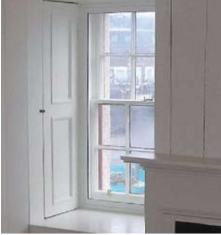
Secondary glazing can be effective and unobtrusive