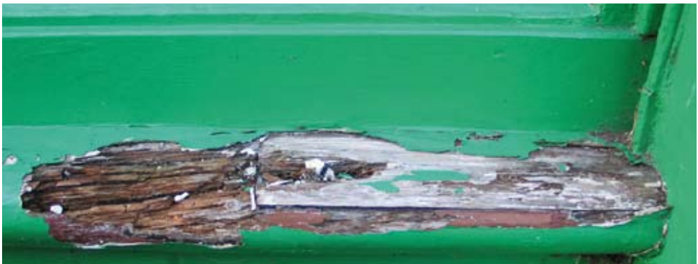
A badly rotten cill

Where paint breaks down, the timber parts are directly exposed to the weather and become vulnerable to decay. Rot is often localised however (the cill is usually the area most prone to decay), and in the majority of cases it is straightforward to repair. If tackled early, this will minimise the amount of material that needs to be replaced. Repainting is also essential to give the window better protection.