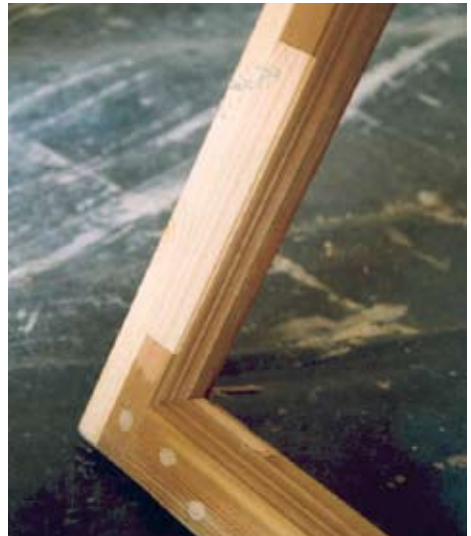
New timber can be used to replace rotten sections

Where decay is localised it is possible to splice in new timber, though care should be taken to select compatible wood with similar characteristics to the original. Severely rotten cills may need to be replaced, either in whole or, in some cases, just the front part, using new matching timber. This can be done in-situ.