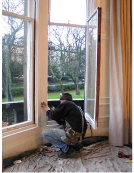
'Simplex' hinging system in operation

windows have very low cills, internal barriers can also be fitted to help prevent accidents.