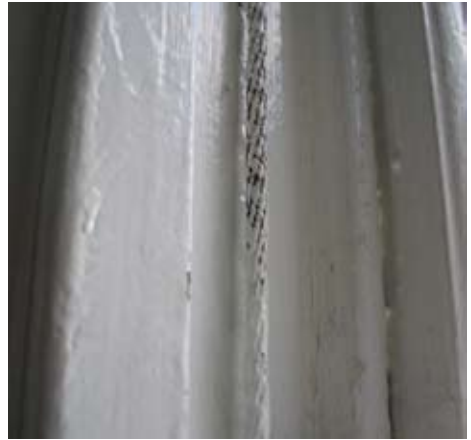
Paint-covered sash cords will make the window more difficult to open and close

Sash and case windows can usually be repaired with relative ease, and regular maintenance will prolong their life by many years. Modern timber can rarely match the quality and durability of the slow-grown softwoods originally used to make these windows. It is therefore best to retain as much of the original timber as possible wherever repair is required.