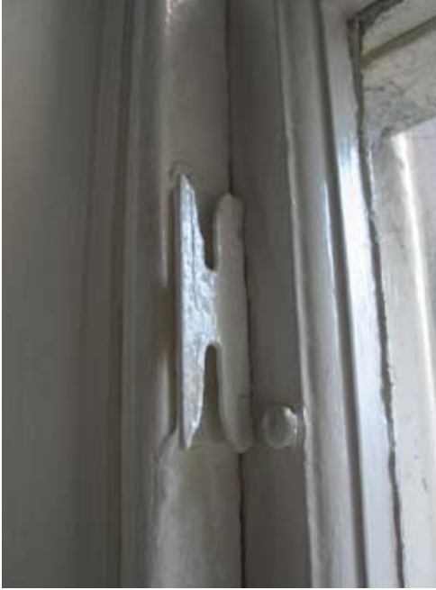
A 'simplex' hinge system