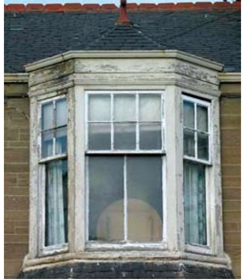
Deteriorating paint leaves timber vulnerable to decay